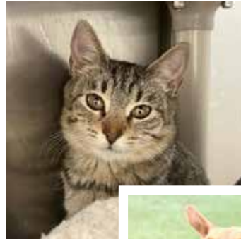
Above: Pinecone (ID A881693) She loves other cats, but humans not so much. Right: Trinity (ID A878629) She's house-trained, cuddly, and great on the leash!

Please check out https://www.austintexas.gov/austin-animal-center for information about volunteer opportunities, as well as foster and adoption information.