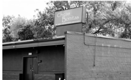
Adios, Chicas Bonitas? Cherrywood's favorite strip club would be razed with most other frontage storefronts from 32nd to south of 38th street under one proposal.

Save the date: Next meeting with TxDOT on Nov. 19 at Asbury Servant Church, 6:30-8 p.m.