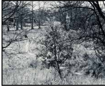
Trees planted, trees removed. And so it goes.