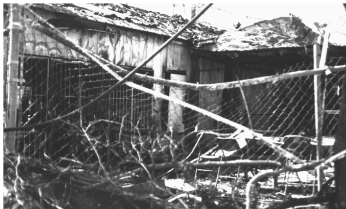
Fire strikes Pato's Good Tacos and destroys the nearly 15 year old home of good food, music and camaraderie.

Strong neighborhood sentiment has been expressed for efforts to rebuild the structure. For years, neighbors have appreciated the good food, reasonable prices, and ample meeting space. Cherrywood will sorely miss this unique enterprise. ■