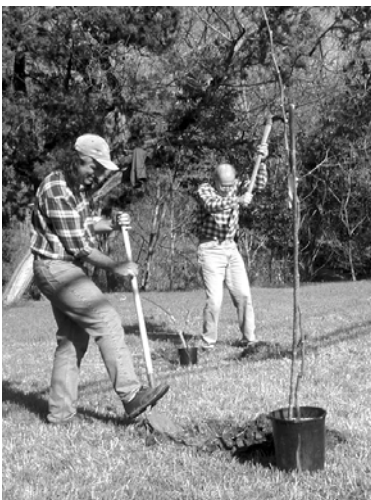
Volunteers step up to the shovel to help plant trees to shade our new park.

The Friends of Cherrywood Green schedule workdays to maintain the green space as needed. Announcements concerning the green space and associated activities can be found on the Cherrywood Neighborhood Association listserv, the green space bulletin board (eventually), or by contacting Katharine Beisner at 708-9407. ■