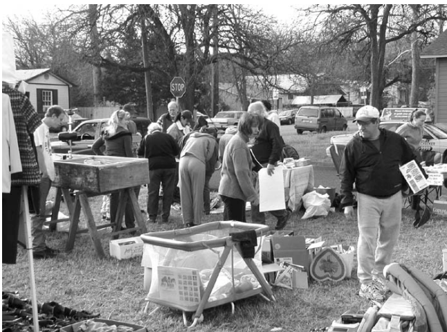
Shopper, donators, and volunteers come together to raise money for the new Cherrywood Green.

After a few organizational meetings, an energetic and welcoming group, calling themselves the Friends of Cherrywood Green came up with a plan. The "Friends" quickly solicited and received the support of the Cherrywood Neighborhood Association (CNA), the Upper Boggy Creek Neighborhood Planning Committee and TreeFolks. The "Friends" soon discovered that the initiative is in accordance with the UBC's