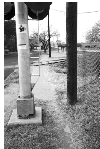
Safe walkable streets are a priority for the neighborhood.