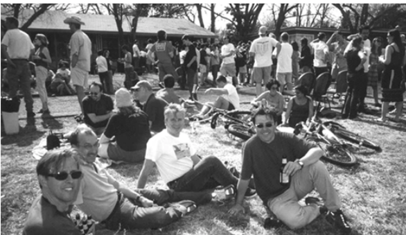
Local, national and international folks kicked-back at the March 14th P2 SXSW BBQ on Sycamore Drive enjoying live music and good food. Bands, like the Australian group Git pictured here, played all afternoon.