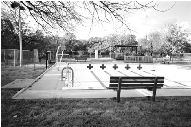
Enhancements to the Patterson Park pool, along with the playground and running "path", are among the goals.