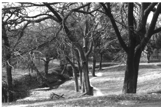
One of Cherrywood's precious greenspaces along Boggy Creek, as seen from Brookview Rd.