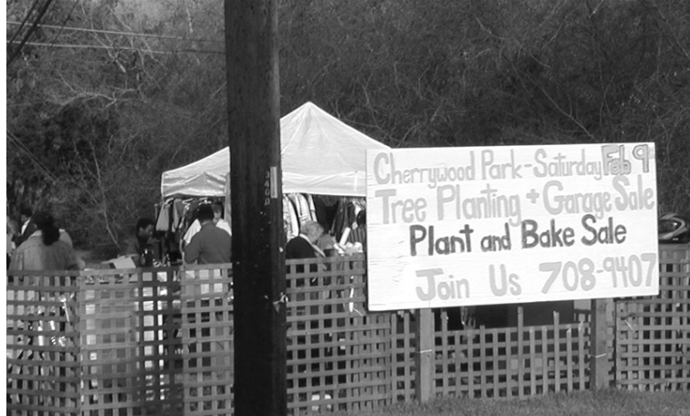
The first big fundraising and beautification event for Cherrywood Green was a success.

neighborhood plan to provide community green space. From TreeFolks, the neighborhood volunteers received experienced advice, technical assistance with the green space design, and trees, all at no cost.