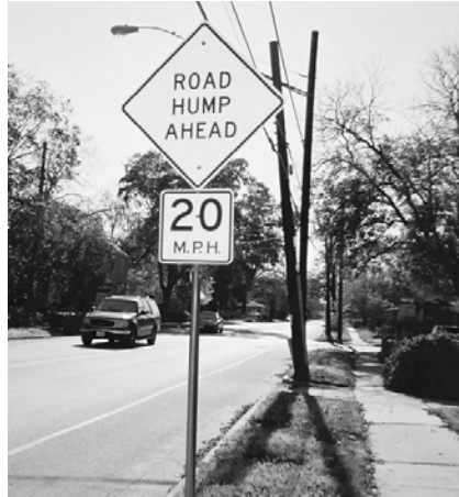
Road humps, pictured here on Duval St., are one method of traffic calming.

These recommendations are presented to achieve the outlined goals and objectives of the CNA. It is the intent of the neighborhood to work cooperatively with the COA Transportation Department and other authorities to implement the goals and objectives of the neighborhood.